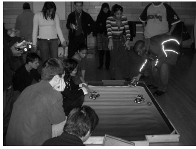
Figure 1: RoboCupJunior soccer

Lab<sup>3</sup> (Erwin, Cyr, & Rogers 2000). A series of seven scaffolded units build in complexity in terms of the robot solution, the task environment and the task(s) to be accomplished. Each unit is accompanied by a case study, with which to situate the technical material being introduced. Following is a brief outline of each unit: