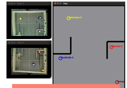
Game Master console