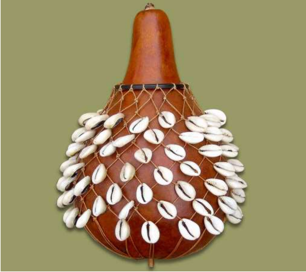
These are dentalium shells on a dress from the North Plains