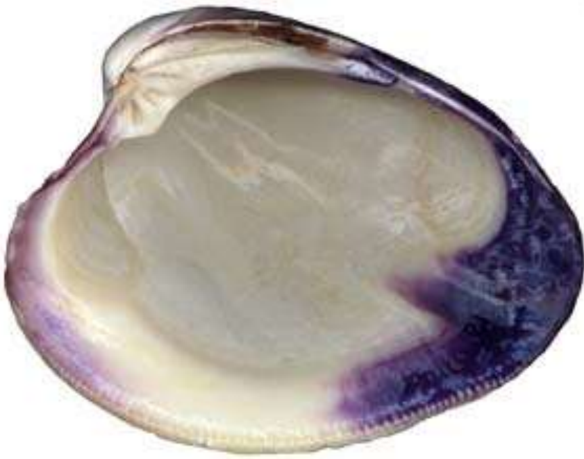
Quahog: Mercenaria Mercenaria