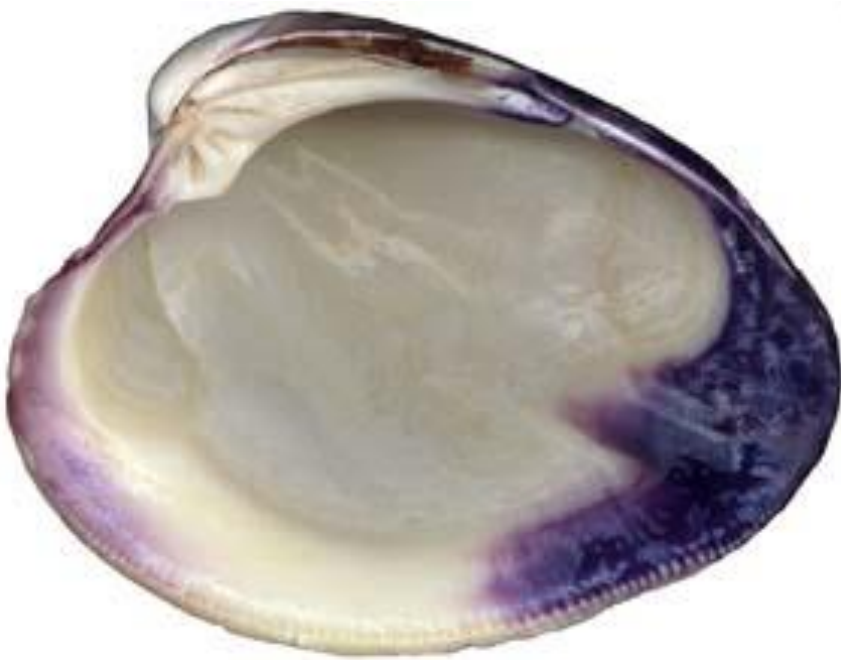
Quahog: Mercenaria Mercenaria