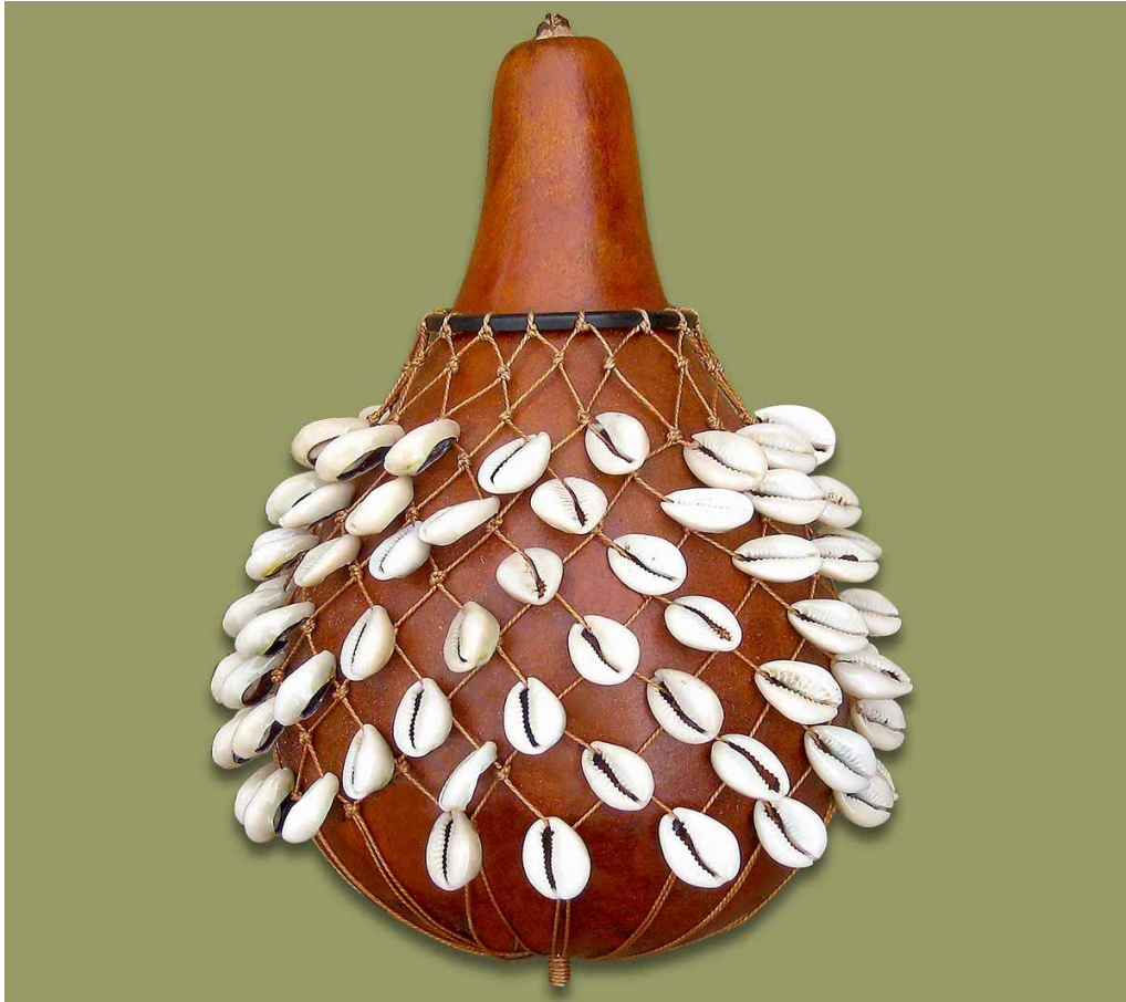
These are dentalium shells on a dress from the North Plains