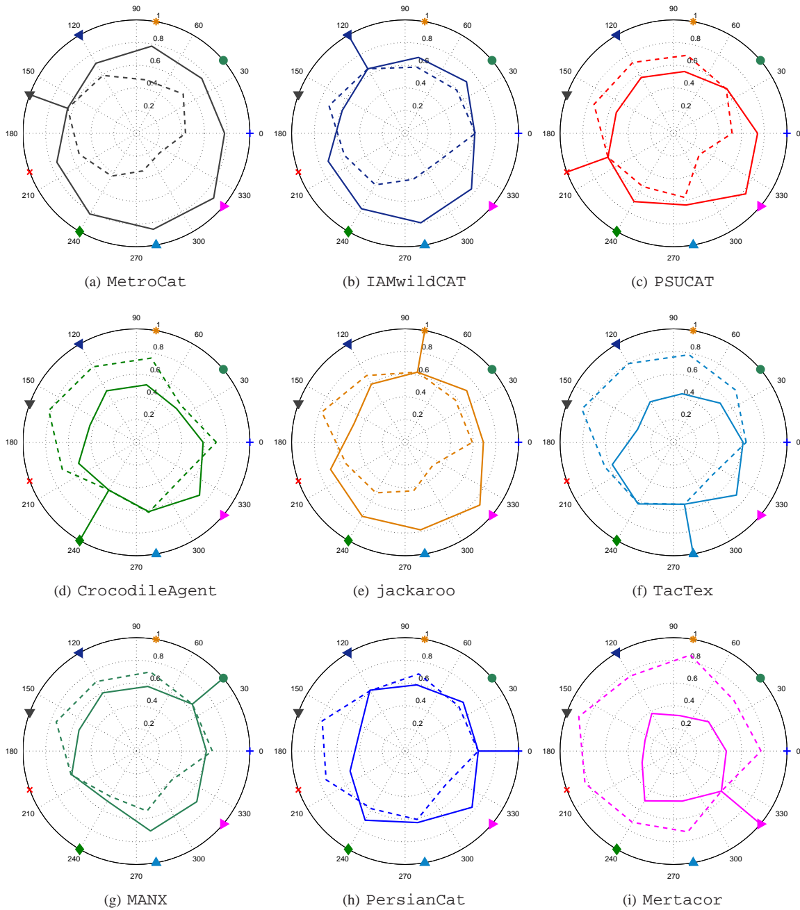
Figure 3: Payoffs of self and opponents in bilateral CAT games. On the outer circles starting from polar angle 0^\circ lists the 9 specialists anti-clockwise : PersianCat ( 0^\circ ), MANX ( 40^\circ ), jackaroo ( 80^\circ ), IAMwildCAT ( 120^\circ ), MetroCat ( 160^\circ ), PSUCAT ( 200^\circ ), CrocodileAgent ( 240^\circ ), TacTex ( 280^\circ ), and Mertacor ( 320^\circ ). The radial coordinates of the 9 vertices of a solid-line polygon represent the corresponding specialist’s payoffs against the 9 specialists respectively, and those of a dashed-line polygon represent payoffs of its opponents respectively. The overlapping vertex of the two polygons in each sub-figure is the self-play game for the particular specialist.