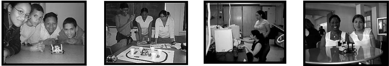
Figure 1. Participants.

located adjacent to Central Harlem. STEP is a 5-week summer program available to New York City public high school students where they attend classes in mathematics and science. The purpose of this program is “to increase the number of historically underrepresented and disadvantaged students prepared to enter college, and improve their participation rate in mathematics, science, technology, health related fields and the licensed professions (1) .” We offered our robotics curriculum to two classes each with about 12 students, ages 14-16. Each class met two times per week for 90 minute sessions. The gender balance was 25% male and 75% female.