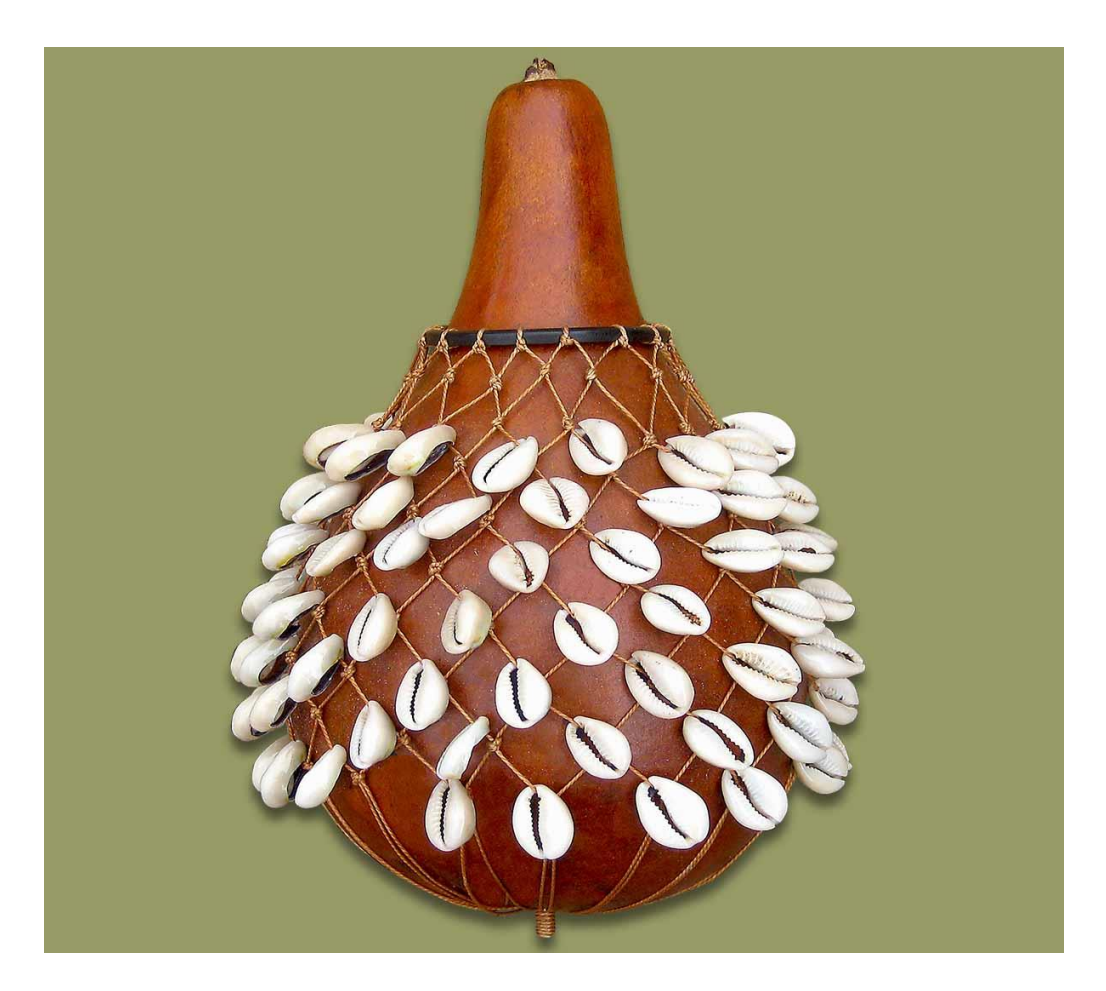
These are dentalium shells on a dress from the North Plains